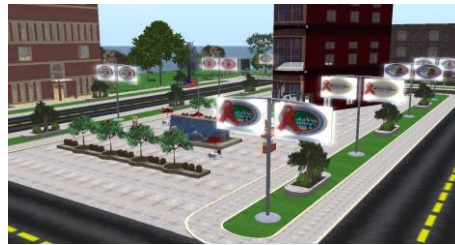
CHARE Village @ Kitley